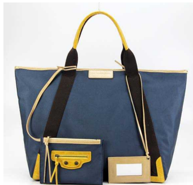
Original Quality Balenciaga Canvas Handbags-Dark Blue