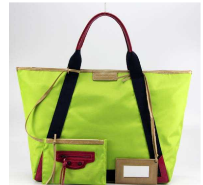
Original Quality Balenciaga Canvas Handbags-Green