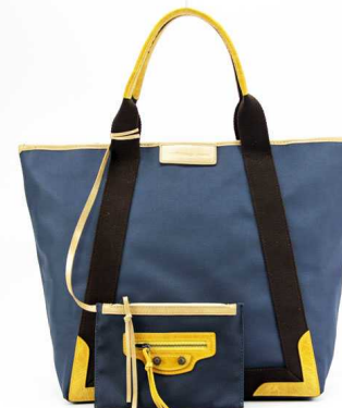
Original Quality Balenciaga Canvas Handbags-Dark Blue