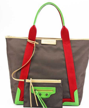
Original Quality Balenciaga Canvas Handbags-Coffee