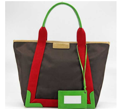
Original Quality Balenciaga Canvas Handbags-Coffee