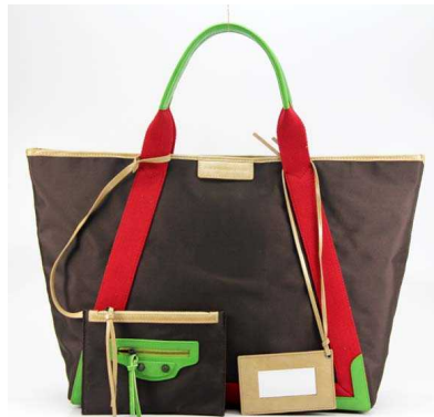
Original Quality Balenciaga Canvas Handbags-Coffee